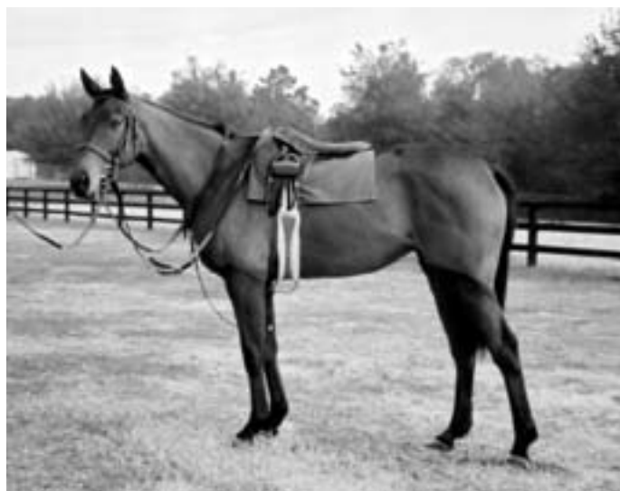
Sire - Elusive Quality , Dam - Closerthanyouthink by Ascot Knight .