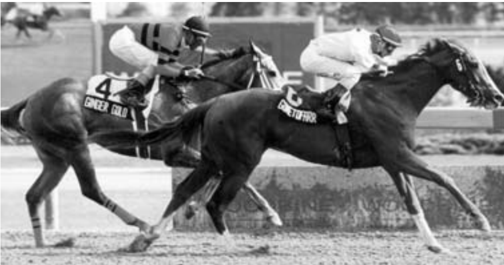
Gonetofarr wins the $150,000.00 Fury Stakes at Woodbine